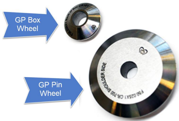
GP Style Cold Roll Wheels